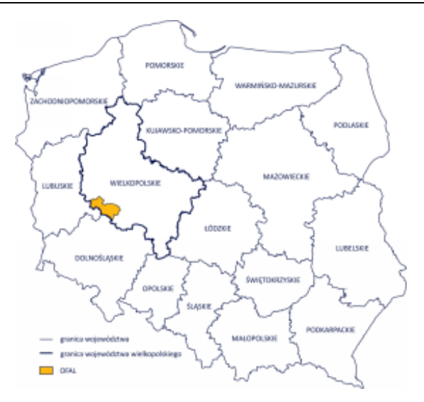
Fig. 2. Location of the OFAL area